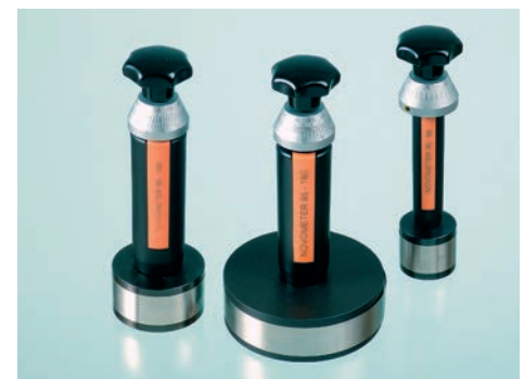
contour gauge NOVOMETER