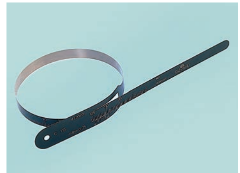
top: C-tape black C-tape with vernier 0,05

Black coated design: for maximum reading contrast