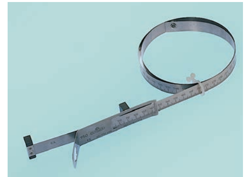
length measuring tape CJL