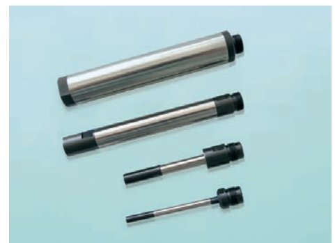
OD measuring depth extensions

Please let us know the diameter of the corresponded OD sleeve with your order. Extensions for measuring sleeves < 4 mm: on inquiry.