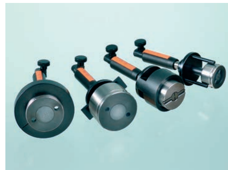
depth stops for OD plug gauge