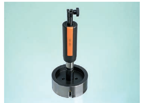
OD measuring sleeve Ø 60 mm