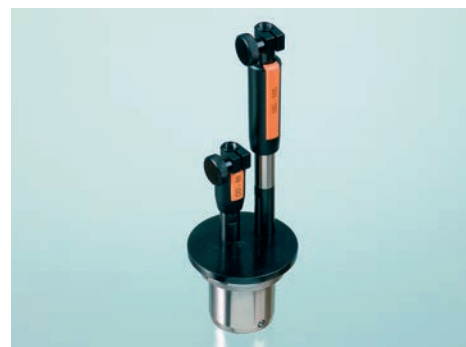
OD plug gauge with two measuring axes