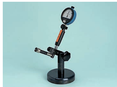
stand for OD with angle piece, plug gauge OD, depth stop, holder and precision indicator