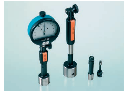
plug gauges OD for various bore diameters

Note: These special versions are not available in every combination! measuring contacts hard chromed and diamond are available from Ø 8 mm; ruby measuring contacts from Ø 3 mm