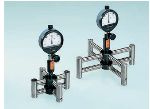
cross sleeve with runners from Ø 130 mm for through and deep bores

ESU setting master therefore see page 15