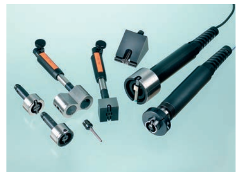
OD measuring sleeves in special design